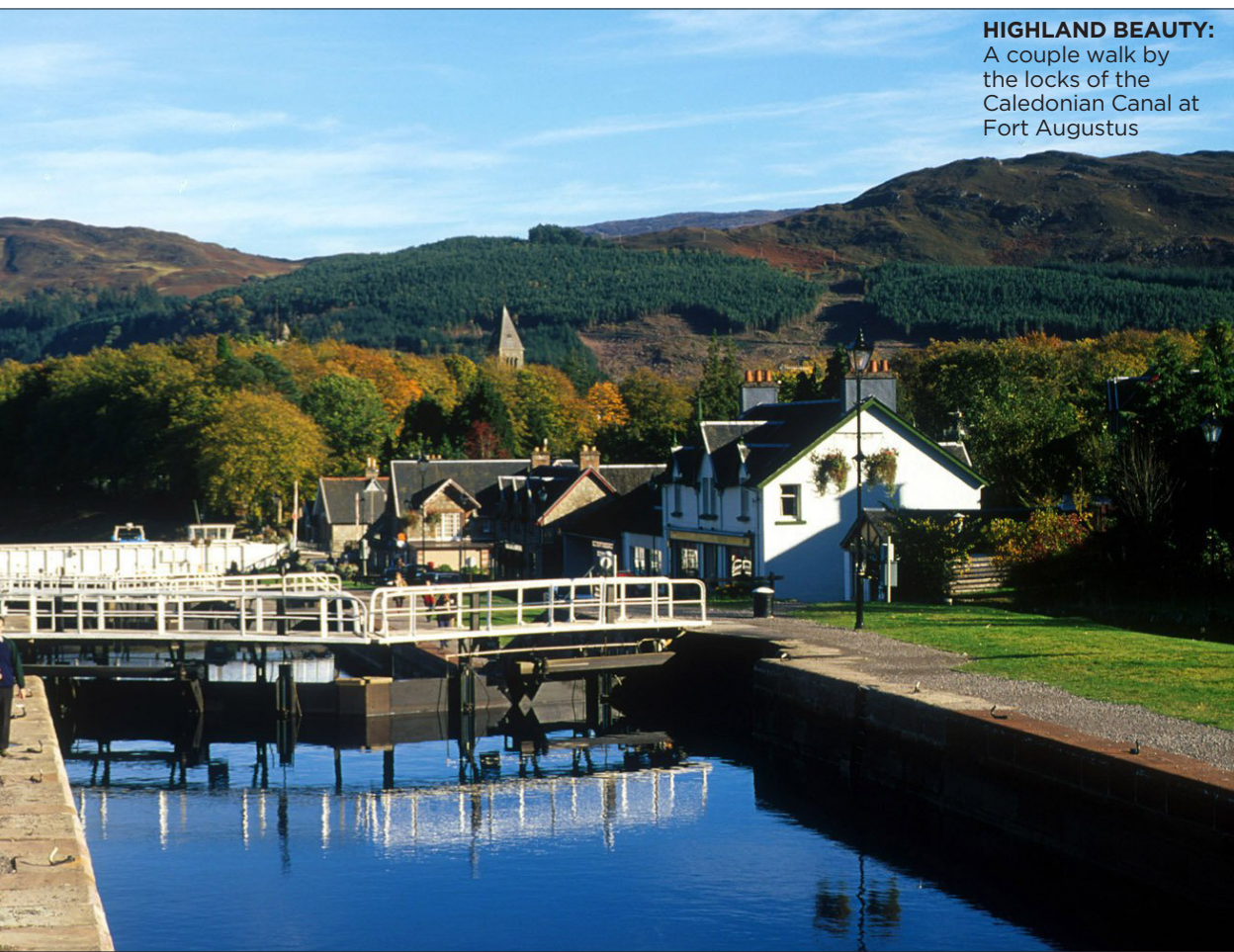
HIGHLAND BEAUTY: A couple walk by the locks of the Caledonian Canal at Fort Augustus

and red-throated divers, dippers, herons, yellowhammers, meadow pipits, crested tits, skylarks, woodpeckers, willow warblers, stonechats, wheatears and if you're lucky, the lord of the skies, a golden eagle.