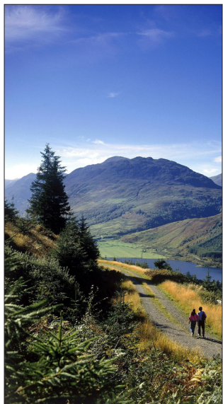
WALK TALL: Forest track on the hillside above Loch Lochy